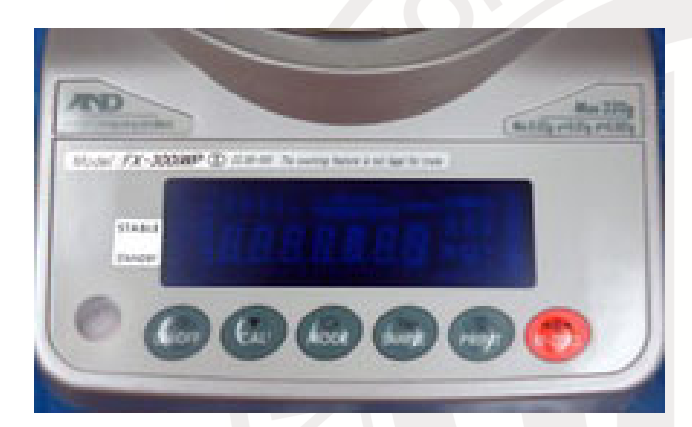
Function Buttons – on/off, cal, mode, sample, print and zero