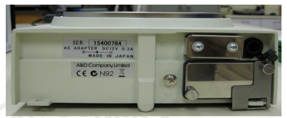
Model FX 3000iWP-P - Rear View