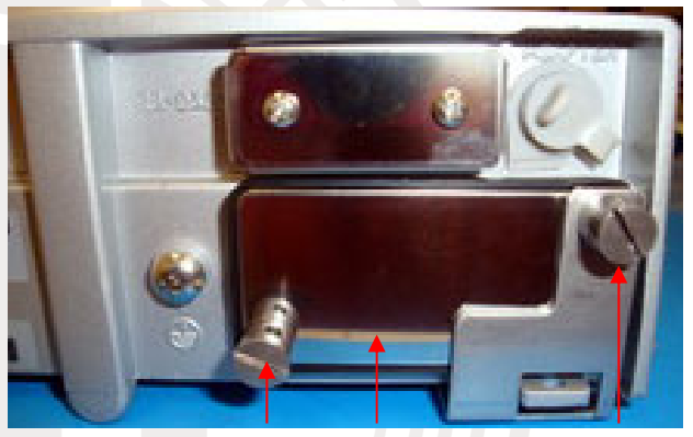
Model FX 3000iWP-P - Calibration Plate and Screws View