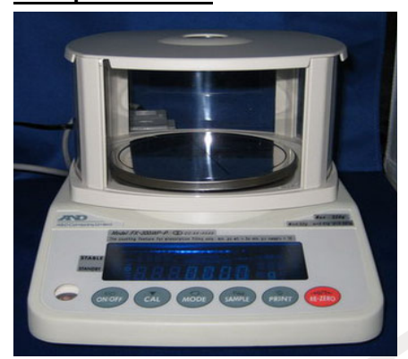
Model FX 3000iWP-P – Front View