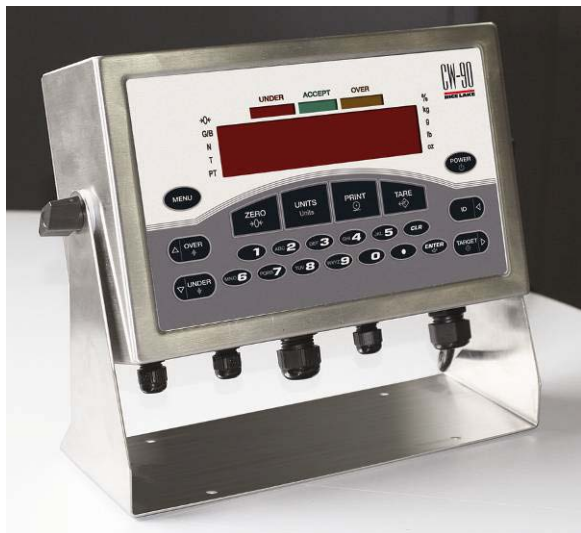
Example of Model CW90-Y: