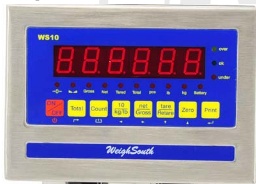
Model WS10 – Front View

Information Reviewed By: J. Truex (NCWM)