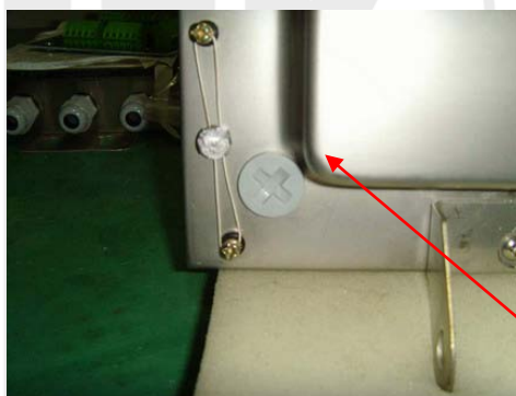
Model WS10 – Rear View Lead Wire Seal