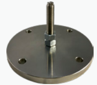
HEAVY DUTY FEET W/ ANCHORING BOLTS