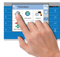
Intuitive operation and touch screen