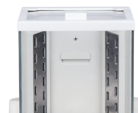
Antistatic ionizer built into the weighings chamber