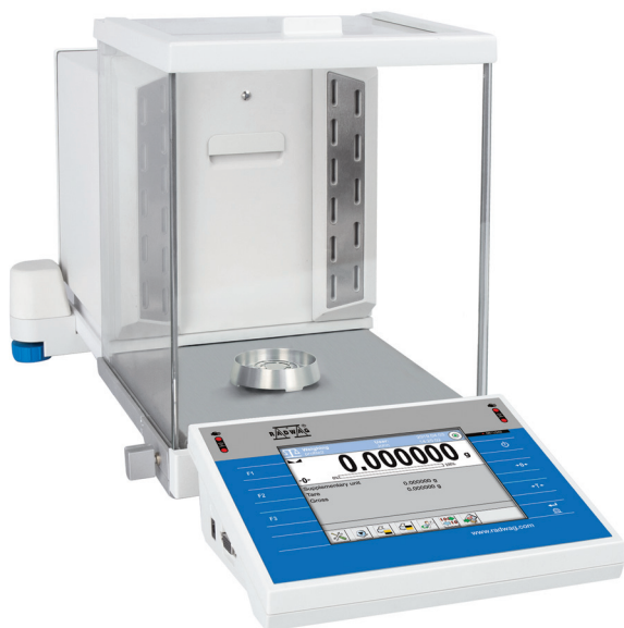
XA 4Y.M.A PLUS with \varnothing = 30 mm weighing pan

SYNERGY LAB Line – New quality of small mass weighing