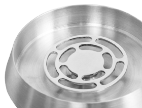
New design of the anti-draft shield