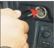
Car lighter adapter To plug in the scale

Includes PC or printer interface through RS-232 serial port.